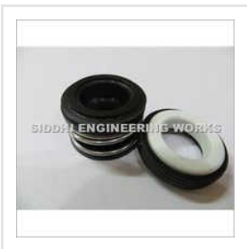
Bellow Type Seal