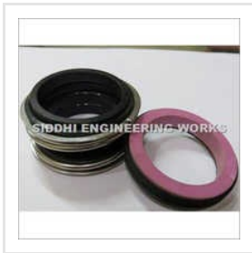
Industrial Robin Type Seals