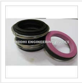
Mg 12 Type Seal