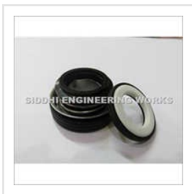
Honda Type Seal