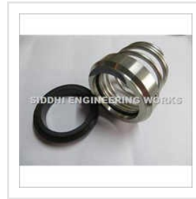
J 2 Type Seal