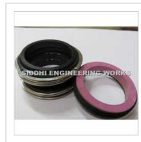
Mg 1 Mechanical Seals