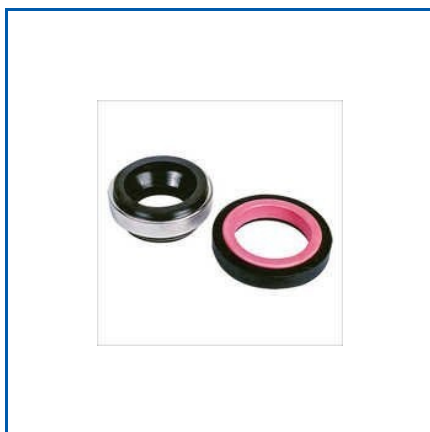
INDUSTRIAL MECHANICAL SEALS