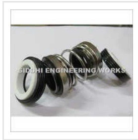
Robin Type (Double Rotry)