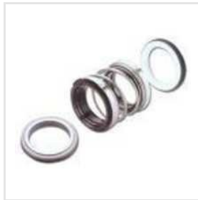
Back To Back Robin Seal