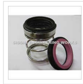
Robin Type Seal