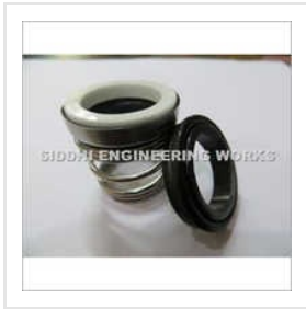
J 1 Taper Seal