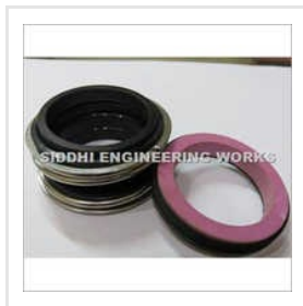
Mg 1 Type Seal