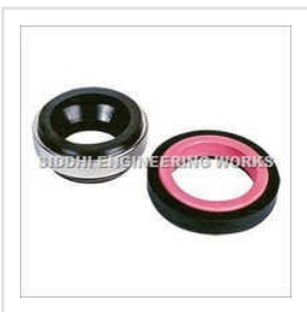
Industrial Mechanical Seals