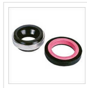
Industrial Bellow Type Seals