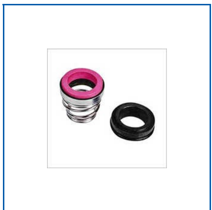
SS MECHANICAL PUMP SEALS