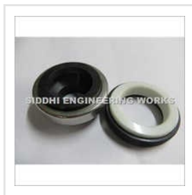
Close Type Seal