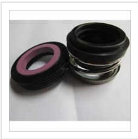
Open Type Seal